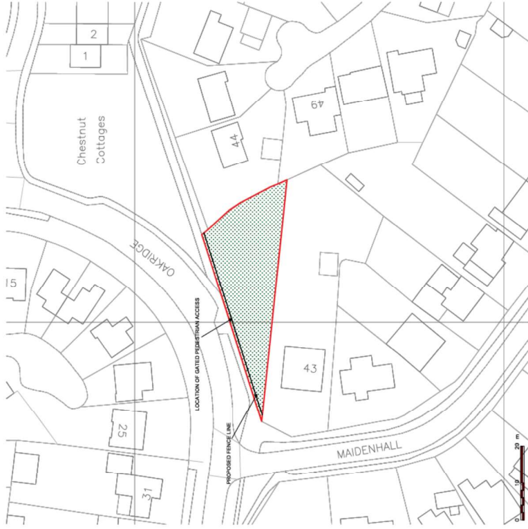
BLOCK PLAN - 1:500