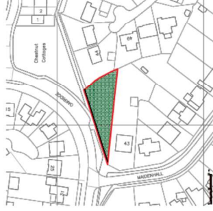
SITE LOCATION PLAN - 1:1250